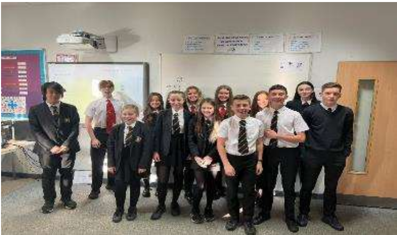
St Ambrose School Sport Committee