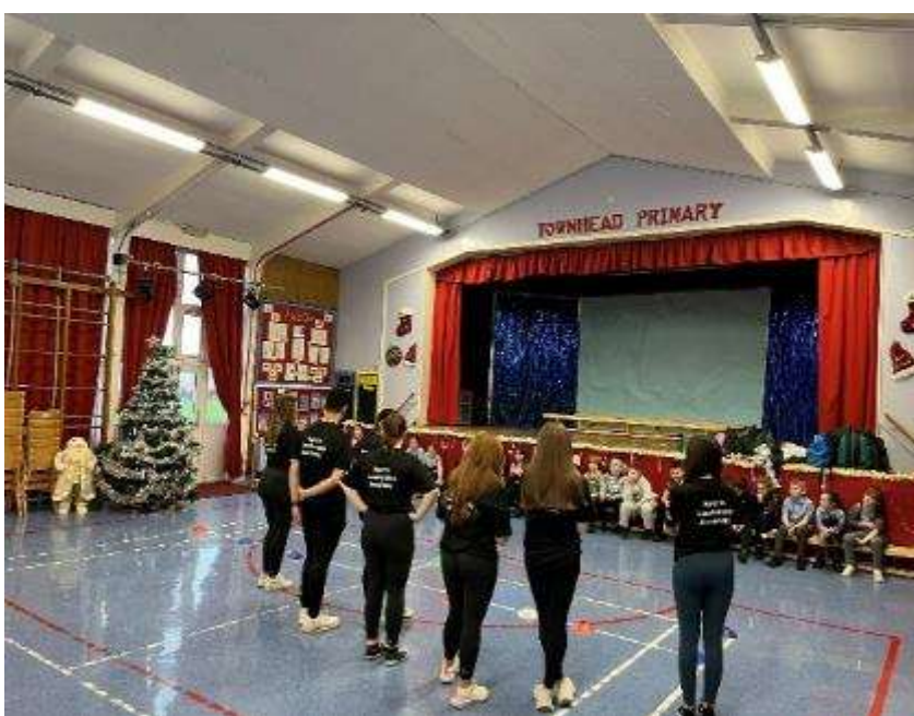
St Ambrose S5/S6 Sports Leaders