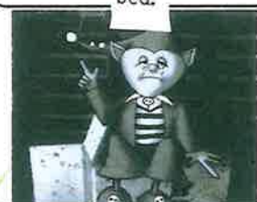
"I am sad. I am the last elf left in the loft."