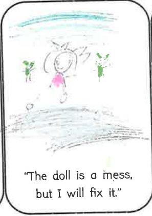
"The doll is a mess, but I will fix it."