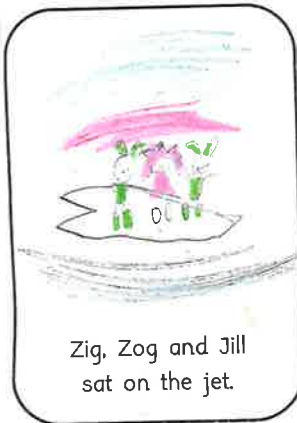
Zig, Zog and Jill sat on the jet.