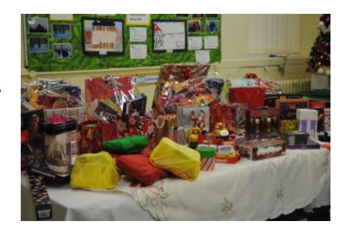
A fantastic array of raffle prizes.

It's been said already, but it's worth saying again—Well Done Everyone!