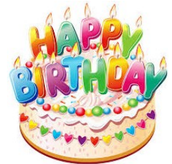
Birthday Card Design Winners