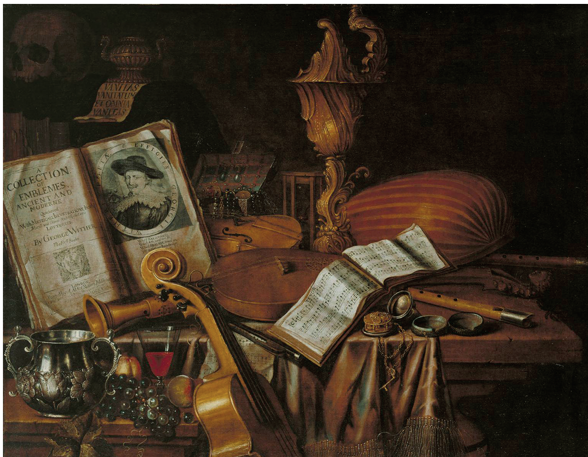
Still Life (1696) by Edward Collier Oil paint on canvas (84 x 108 cm)

2. Comment on this painting, referring to