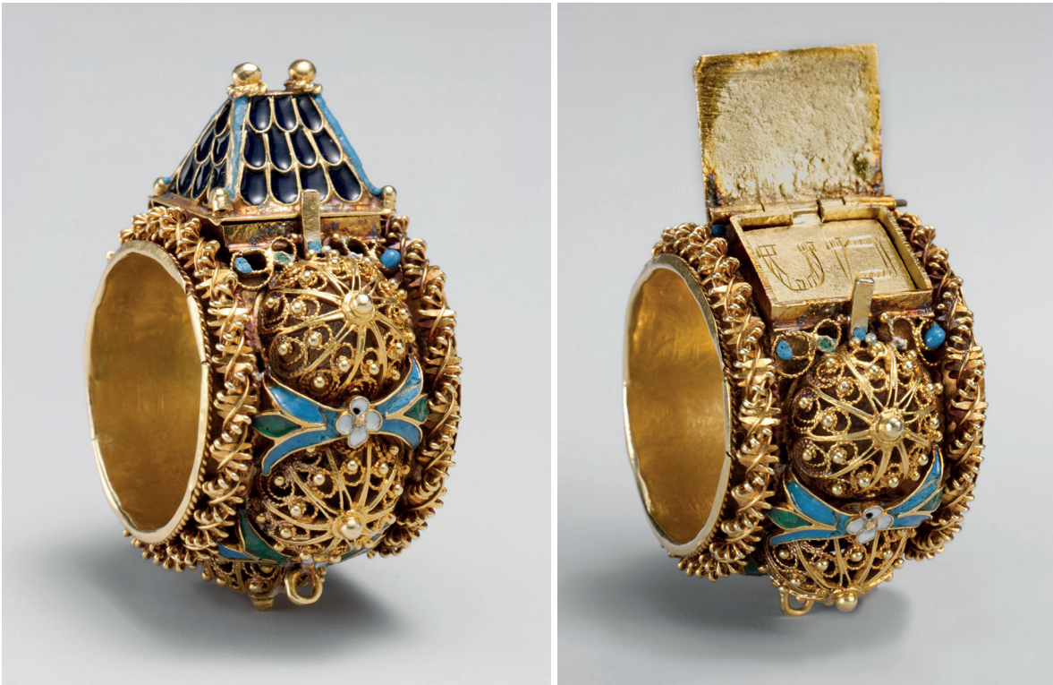
Engagement ring (17th century) by an unknown designer