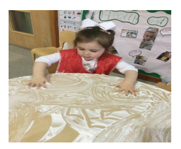
Curiosity creativity and imagination are encouraged daily.