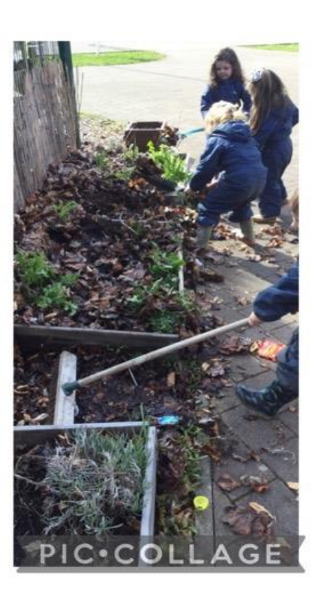
Taking care of our environment.