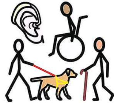
UNCR Article 23