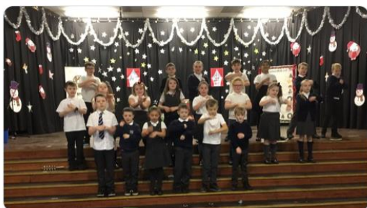
Noble Primary School @Noble_P_S · 1h P5/4 perform #LastChristmas