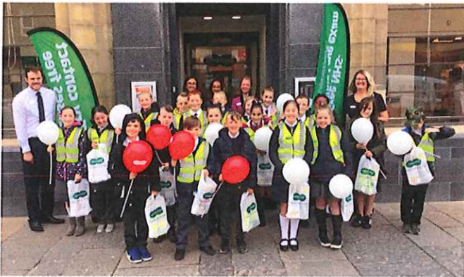
P5/6 visiting Spec Savers, Bellshill

A massive thank you to parents, family, friends who contributed to our World of Work week. Feedback from everyone has been extremely positive. The children's excellent behavior and manners were commented upon many times, a credit to you and our school community. The children learned a range of skills required to do many different jobs and have an increased awareness of the world of work.