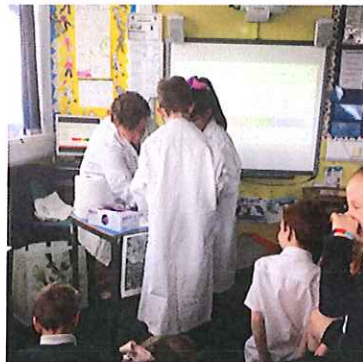
Two of our many parent volunteers talking about the skills needed to do their job.