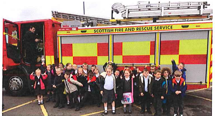
Special visit from the Fire Brigade to various classes.