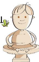
is still, he doesn't fidget