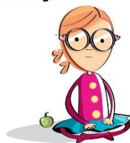
looks at the speaker

Who's that knocking at my door? Stevie Still we all adore. Open wide let's look and see Sitting still so perfectly! Who's that knocking at my door? Stevie Still we all adore.