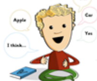
takes a turn to speak

Who's that knocking at my door? Tommy Talk we all adore. Open wide let's look and see. He can talk to you or me, Who's that knocking at my door? Tommy Talk we all adore.