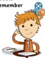
remembers what he heard