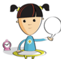
waits her turn