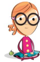
looks at the speaker