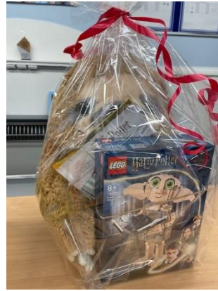
Large sloth and Lego pack