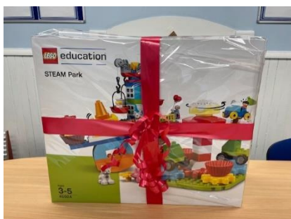
Large Lego STEAM kit

Our Christmas raffle will take place over the next few weeks with some great prizes up for grabs (please see below). If you would like to support this initiative and be in with a chance of winning, then you can send money for the raffle in with children next week. The price will be £1 per number so for every pound sent in a different number will be provided. We will keep a spreadsheet with who has each number and then prizes will be drawn using a random number generator during the last assembly before Christmas. Each day for the next two weeks, children will be allowed to go and buy raffle numbers at some point in the morning and the number will be sent home with them. The main prizes are below and there will be some more smaller ones drawn on the day. As always, we would appreciate your support with this fundraising activity.