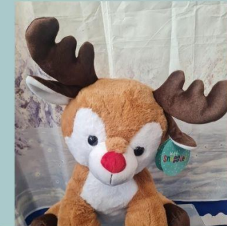
GUESS THE REINDEER'S BIRTHDAY 50P, 3 FOR £1