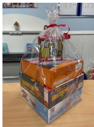
Games and jigsaw pack