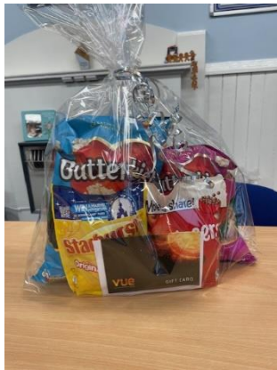
Cinema voucher and sweet treats