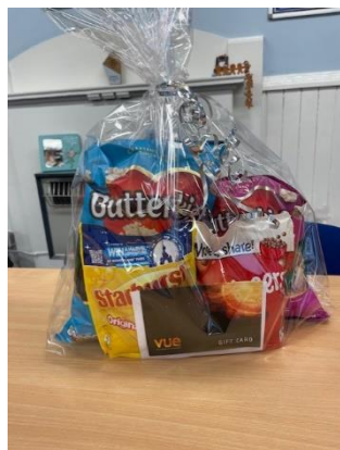
Cinema voucher and sweet treats