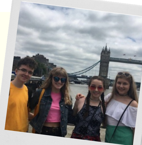
London June 2018