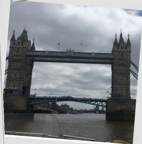
London June 2018