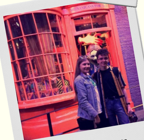
London June 2018