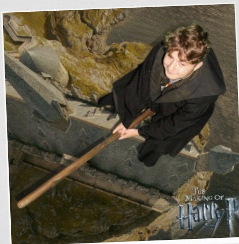
London June 2018