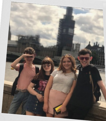
London June 2018