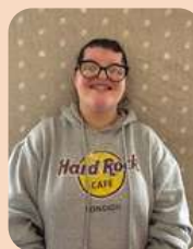
Mell Support Worker