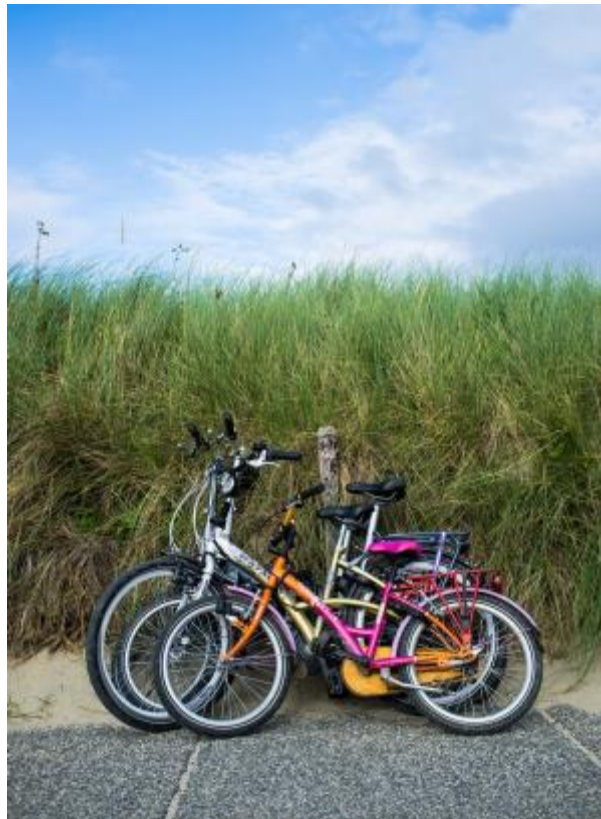
1 - Bike recycling and Reusing

Off to a flying start this term, it's hard to believe the children have been back for nearly two weeks already.