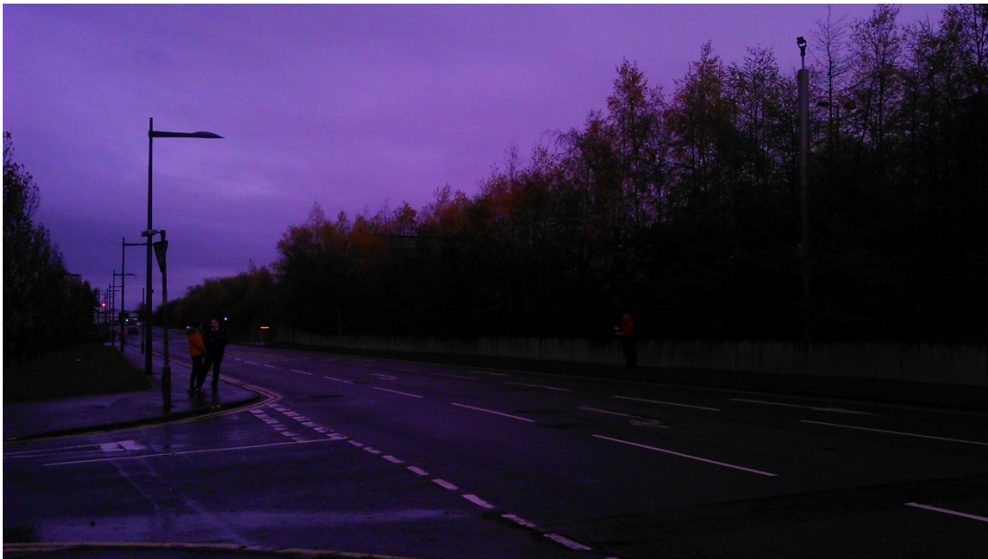
Higher Geography pupils conducting a traffic survey in Glasgow Harbour

Higher Geography pupils visited the Glasgow Harbour and the Gorbals to conduct primary research on the regeneration strategies in these areas. Pupils used a large variety of research techniques to collate detailed information to use in their Higher Assignment. They conducted questionnaires with local people, completed traffic surveys, an environmental quality index and took photographs for comparison purposes. This work has supplemented case study research done in class using the internet and books to learn about the history of housing and the environment in Glasgow and why the changes were necessary.