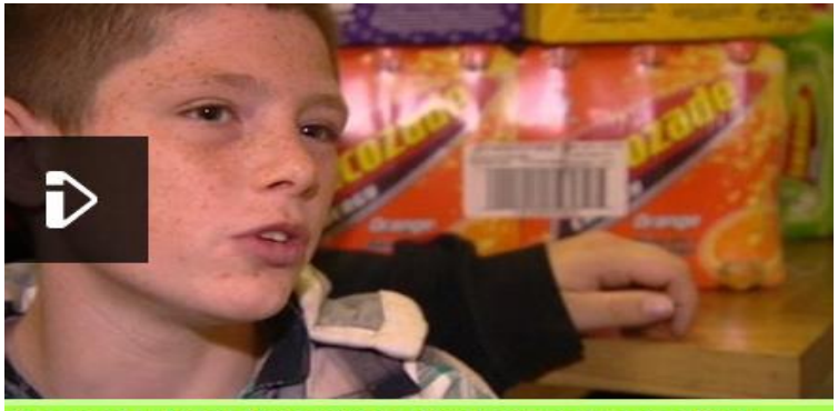
Tommie was making up to £200 a day from selling

Read the article, 'Schoolboy suspended for selling sweets to classmates'.