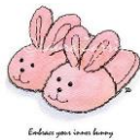
Endless your shoes bunny

Can we remind parents to ensure their child has soft indoor shoes to wear while in the playrooms? Can parents of children who attend the 2-3 room ensure that they use the shoe covers provided before entering the playroom? This will support us in keeping the environment for children clean.