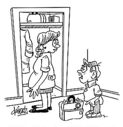
"This is a fine time to leave! What if the doctor delivers the baby while you're out!"

Speakeasy can help arm you with the information, knowledge and skills to answer your childs questions, feelings or fears, at any age, any stage and in any circumstance.