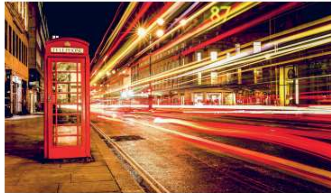
Untitled (2017) by Luis Llerena

Refer to Image 1 on the supplementary sheet when answering this question.