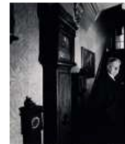
LS Lowry (1975) by Derry Moore