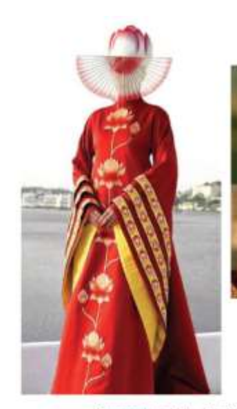
Costume design for the film 'The Fall' (2006) by Eiko Ishioka