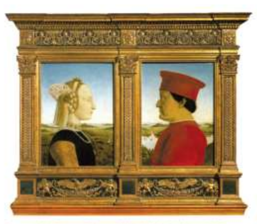
Portraits of the Duke and Duchess of Urbino (1467-72) by Piero della Francesca diptych<sup>1</sup> painting, tempera paint on panel (each portrait 47 x 33cm) <sup>1</sup>diptych — a painting in two parts