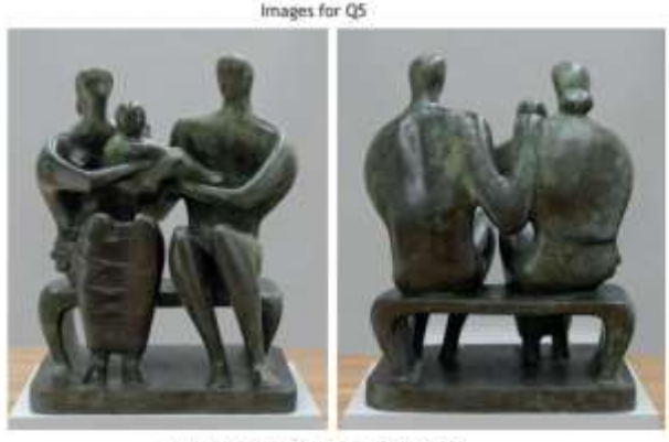
Family Group (1948-49) by Henry Moore bronze sculpture (145 x 118 x 70cm)

You must fully justify each point you make.