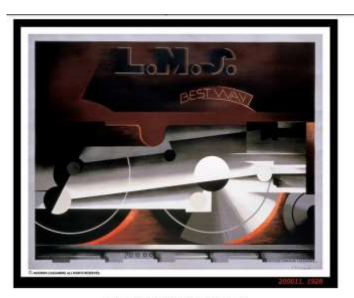
Poster design (mid-1920s) by AM Cassandre