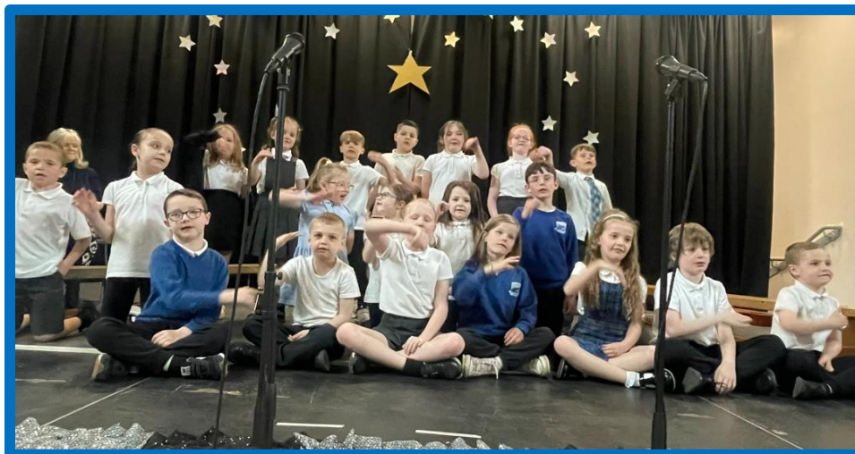
Memories from last years Primary 3/2 Assembly Stars!

All children will be provided with the opportunity to showcase their learning with their classmates. You are invited to attend, enjoy the performance and celebrate with a refreshment with your child and their class teacher. Assembly times this session for each class is: