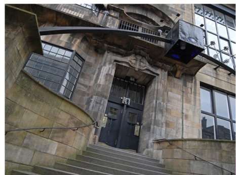
Glasgow School of Art,

In his own lifetime Mackintosh's work was not well known in Scotland. In Europe, however, Mackintosh's style was quickly appreciated and in Germany and Austria his work received the status that he never truly gained at home. Mackintosh's designs were influenced by geometric shapes, the natural world, Scottish Baronial architecture, Celtic and Japanese art. Today Mackintosh-influenced artwork and designs, like his rose design, have become hugely popular and can be found on anything from fabric, home accessories, stained glass, bags, and wallpaper, to furniture, jewellery and even food!