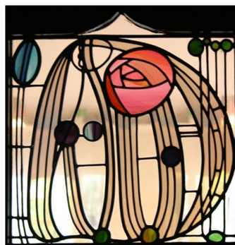
Stained glass window at The Hill House, Glasgow