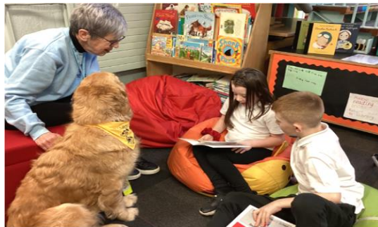
Pupils enjoy reading with Breigh - Therapet

We encourage children to develop their writing skills through a variety of genres: narrative, recount, instructional, information, explanation and persuasive texts.