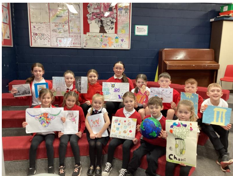
Pupils learning about people in place, people in the past and people in society.