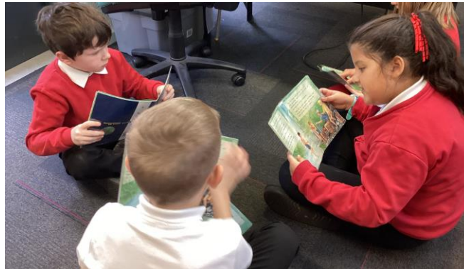
Younger pupils enjoy reading together

Chapter Books and a variety of novel studies. We also use a variety of non-fiction books. The children are encouraged to read for both enjoyment and information.