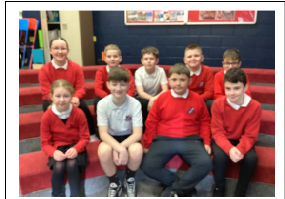
Sports Committee – 2023-24