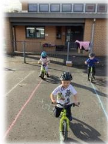
Play on Pedals Programme