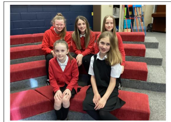
Reading Schools - 2023-24