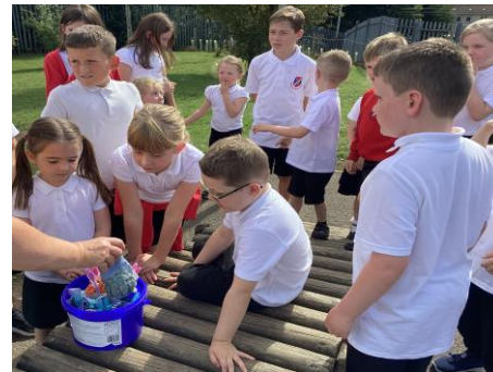
We Plan and Improve Together - Infants and Seniors engage in Peer Learning