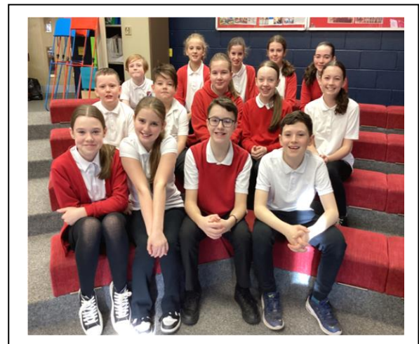
Digital Leaders – 2023-24