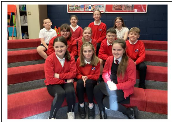
Young STEM Leaders – 2023-24

Pupil Representatives include the School Captain, Vice-Captain and Prefects. They have opportunities to support the work of the school and the Parent Council and PTA throughout the session. Remits for members of Pupil Forums, the School Captain, Vice-Captain and Prefects are located on the school's website. The Community Pupil Partnership Team also support the work of the school through the leadership they provide.