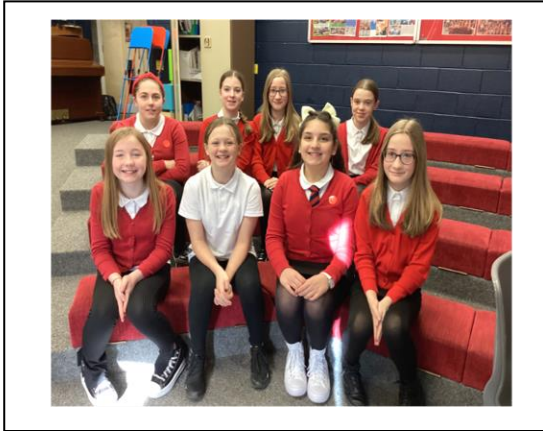
ECO Committee - 2023-24