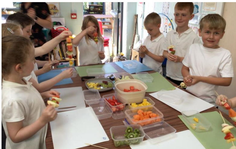
Balmalloch pupils have fun learning about 'Healthy Eating'

Pupils in Balmalloch Primary School develop their understanding of a healthy diet, which is one composed of a variety and balance of foods and drinks. They acquire knowledge and skills to make healthy food choices and help to establish lifelong healthy eating habits. They develop an appreciation that eating can be an enjoyable activity and understand the role of food within social and cultural contexts. They explore how the dietary needs of individuals and groups vary through life stages, for example during pregnancy and puberty, and the role of breastfeeding during infancy. Learners develop knowledge and understanding of safe and hygienic practices and their importance to health and wellbeing and apply these in practical activities and everyday routines, including good oral health. They develop awareness that food practices and choices depend on many factors including availability, sustainability, season, cost, religious beliefs, culture, peer pressure, advertising and the media.