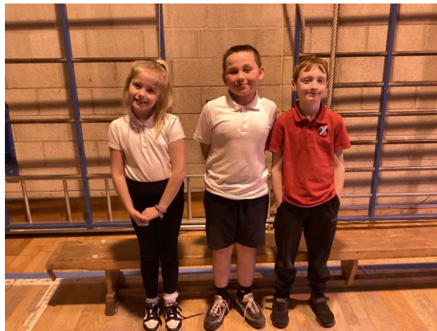
BPS 'PE Uniform'

For Health and Safety reasons the only jewellery allowed in school is a watch and small stud earrings, both of which must be removed for P.E.