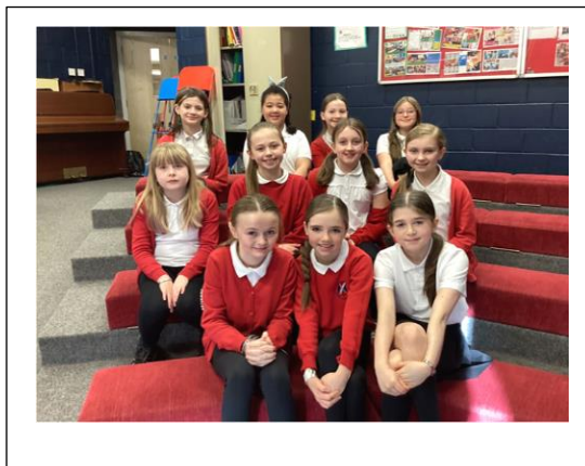
Pupil Council - Rota Kids - 2023-24