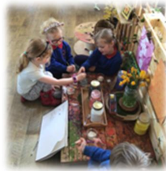
Child Led Learning Experiences