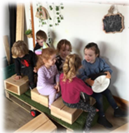
Building Positive Relationships with others