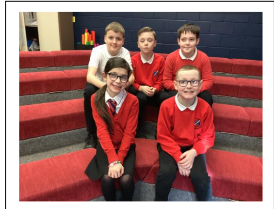
John Muir Award Group 2023-24