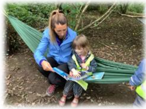
Forest Kindergarten Sessions