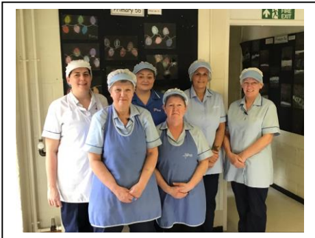
BPS 'Catering Staff'