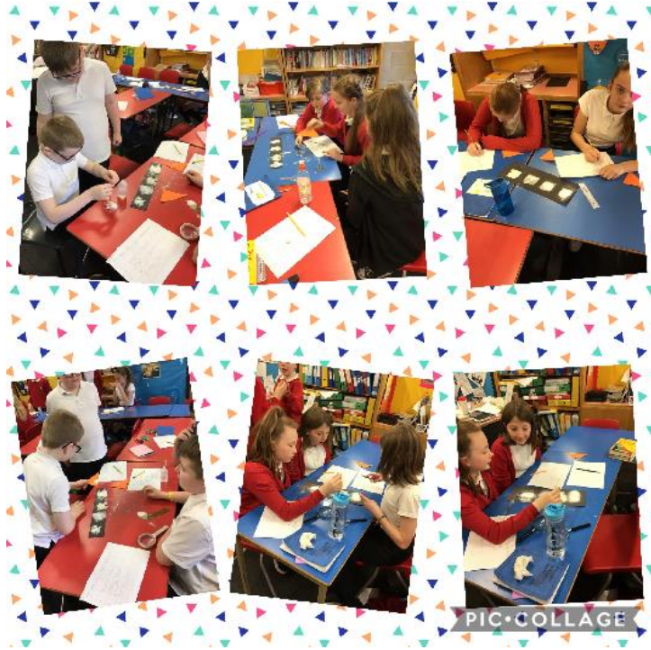
Senior pupils learning through Science and Investigation – STEM

Throughout your child's primary education, they will be exposed to a variety of topics within these areas. There exists, at present, a planned framework of topics to ensure that there is a balance and breadth in what your child is learning. The main emphasis is placed on the child acquiring key ideas and skills, which will help them to gain a better understanding of the world we live in. Where possible, we try to arrange visits related to the topics the children are working on, and these prove to be both informative and pleasurable for the pupils.