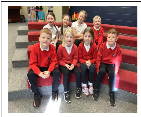
Rights Respecting Schools Committee – 2023-24