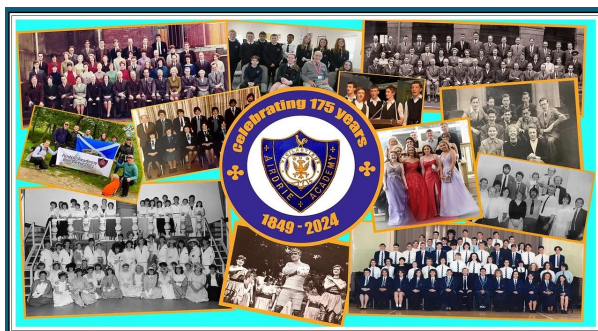
1 - Airdrie Academy Voices

I am delighted to share the completed online anthology of stories relating to the people of Airdrie Academy over its 175 year history.