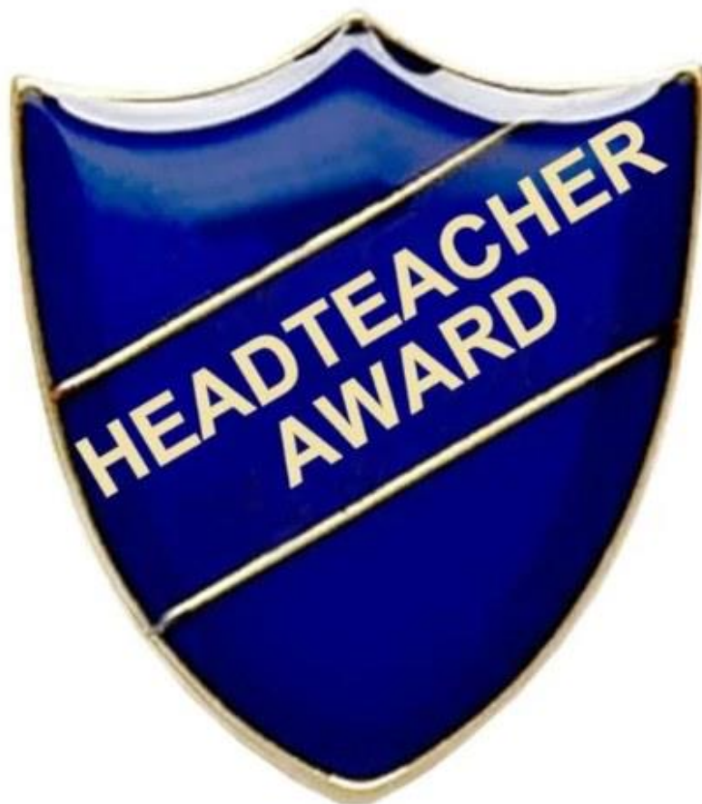
2 - Head Teacher Award - Airdrie Academy