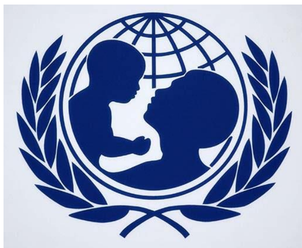
5 - UNCRC Rights Respecting Schools