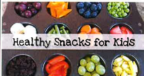
Healthy Snacks for Kids