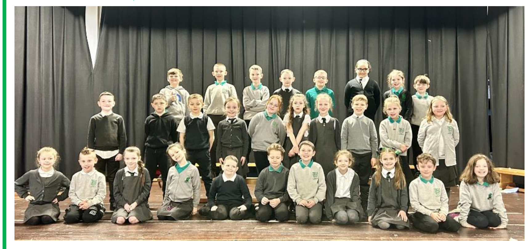
Room 11 treated us to a fantastic assembly this week. They performed to the whole school and also gave a special performance to their friends & family. Great job R11!