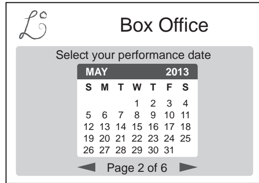
Box Office web page

(c) The two web pages above use different types of navigation.