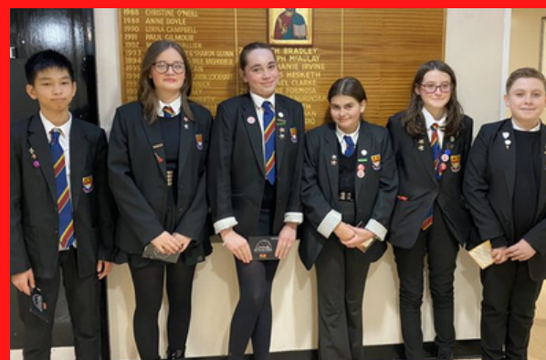
THESE 6 PUPILS ARE THE 1ST TO ACHIEVE 100 MERITS

Senior pupils begin prelims on Wednesday 10 January. Prelims run until Friday 26 January. We have already published the prelim schedule. This has been emailed to parents and is also available on the school website. Please note there is no study leave during prelims.