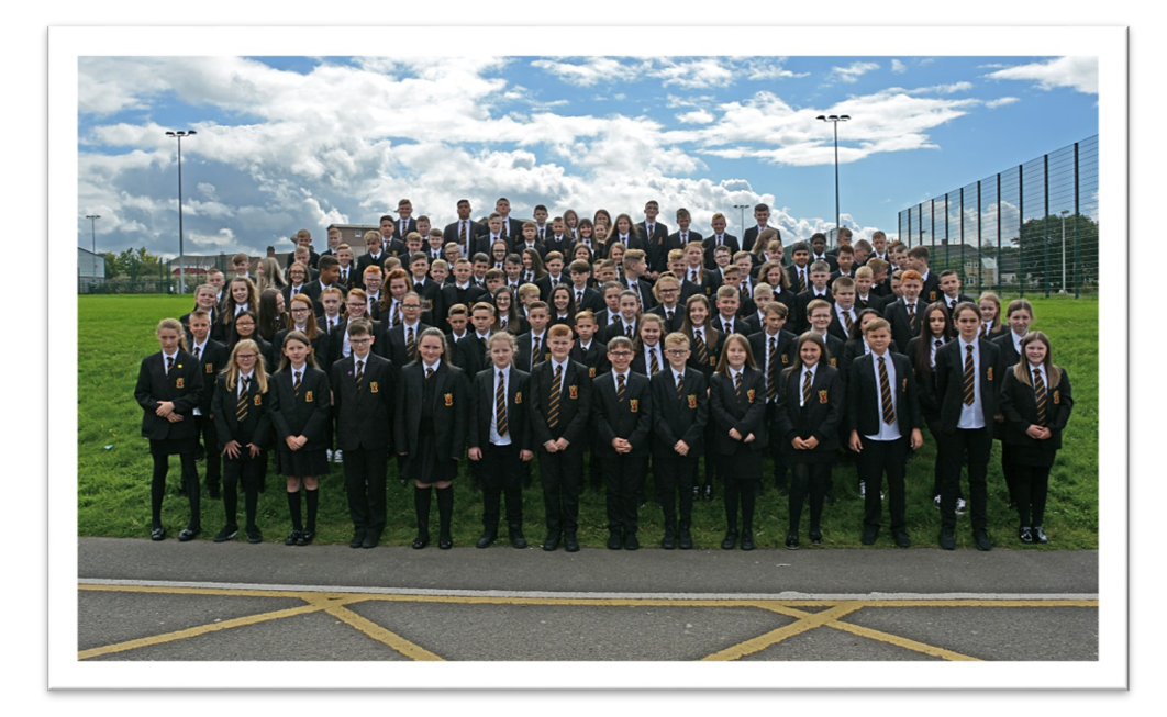
Welcome to our new S1 pupils for school session 2018-19. All at Braidhurst wish you the very best of luck in the year ahead.