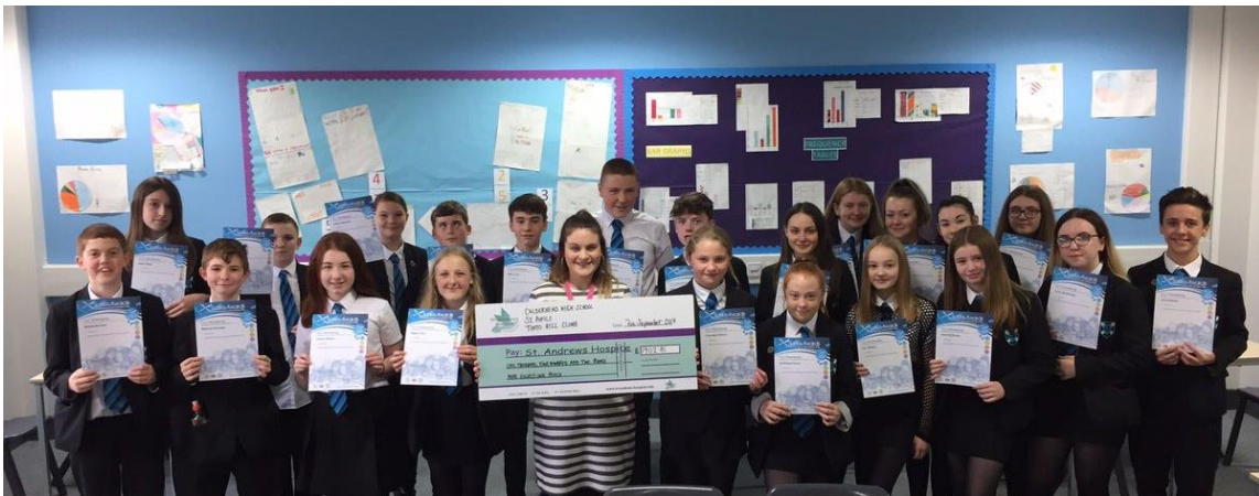
St Andrew's Hospice, Tinto Hill Sponsored Walk

Similarly, at the end of S4 and S5, Pupil Support staff meet with pupils to discuss option choices for the range of subjects they hope to study in the following session. Parents will be invited to attend an information evening about the curriculum in the Senior Phase of a Curriculum for Excellence, and provisional choices are indicated in March each year. These choices are finalised in August following the publication of National Qualifications results. Alterations are sometimes required in the programme of study at this stage and Pupil Support staff liaise with pupils and parents about this.