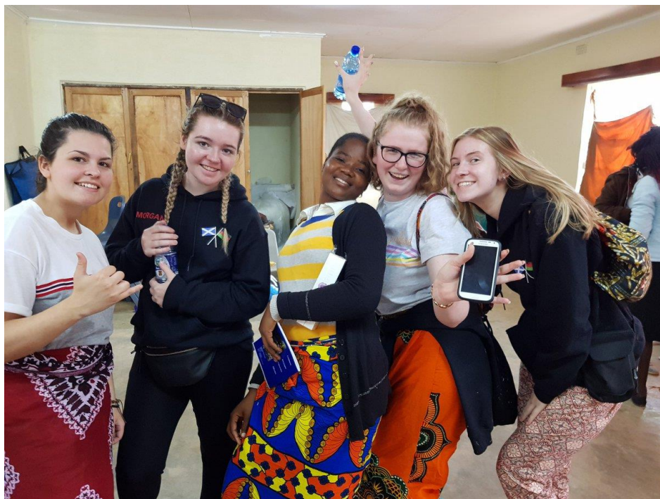
Malawi 2018, supporting our partner school Thuchila

PSHE periods at S5/6 level include Careers Education, community involvement, and a "life skills" programme which helps to bridge the gap between school and community.