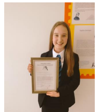
Fundraising for Thuchila