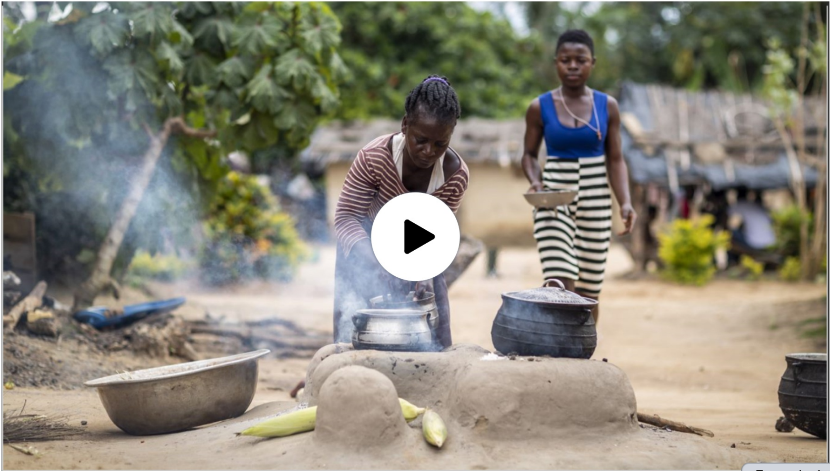
Example 4 of 6

This page has a video. Use Seesaw to play it.