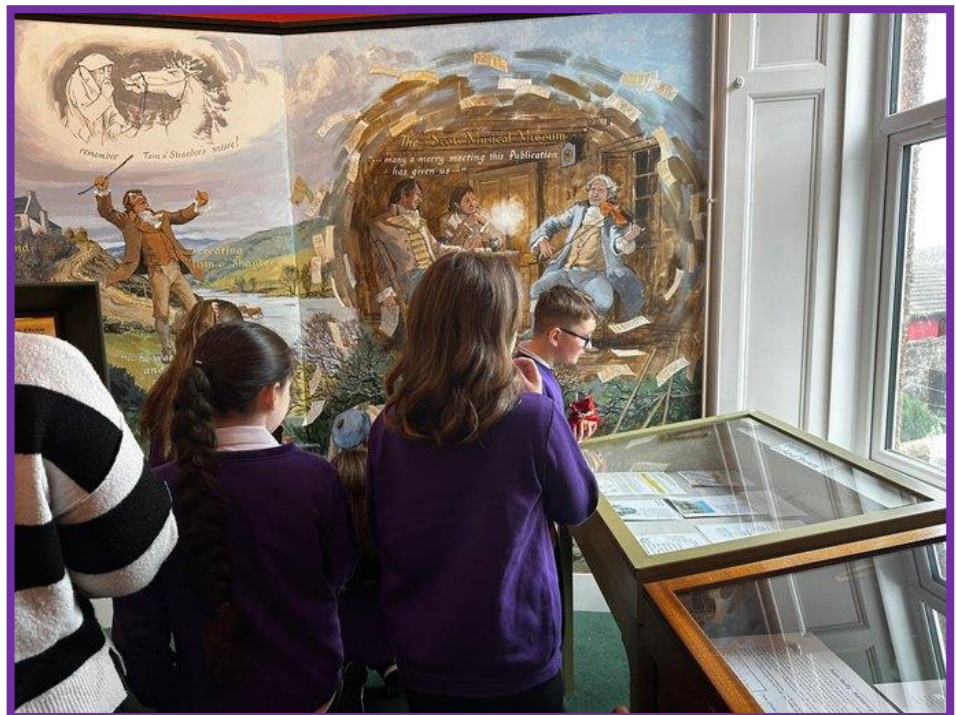
Wellwood Burns Centre & Museum