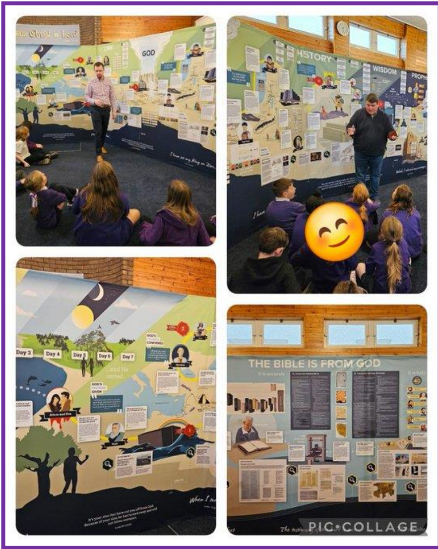
P4-7 Visiting the Gospel hall Bible Exhibition