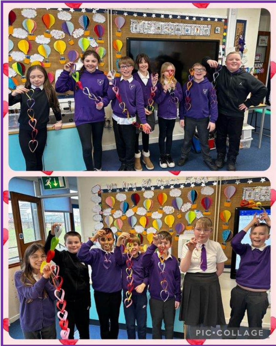
Valentine Activities in P6