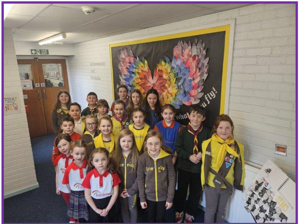
Founders Day 2024