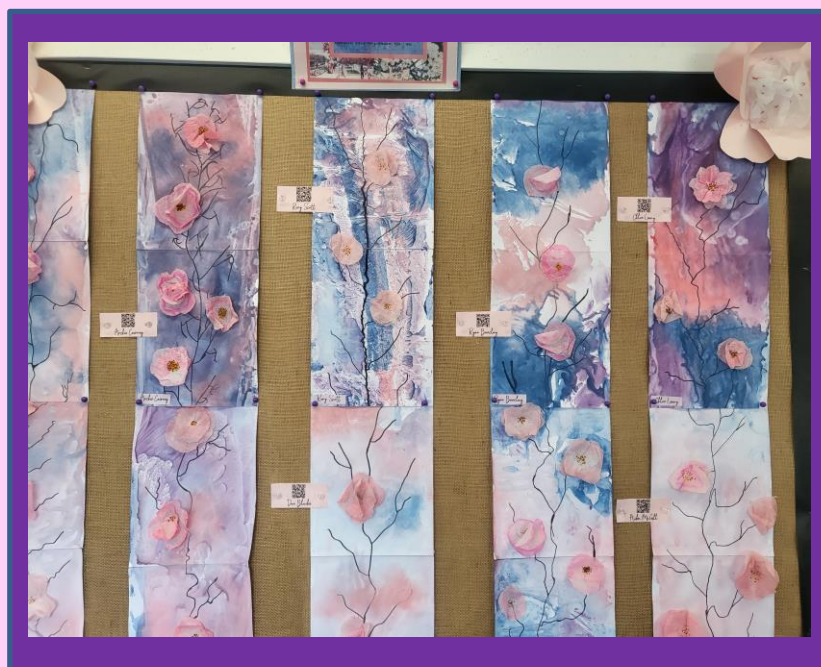
Apple Blossom by P4/5M