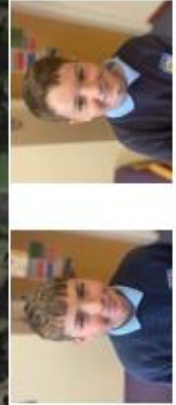
Junior Road Safety Officers

DO park alongside the field wall and encourage your child to walk.