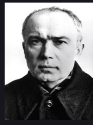
St Maximilian Kolbe