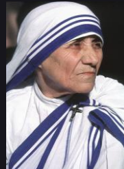
St Teresa of Calcutta