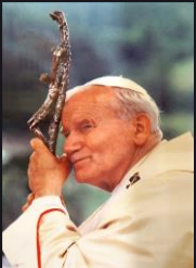
Pope St. John Paul II

St Matthew's Academy Pupils are sorted into 6 Houses or Pastoral Groups Each House has a different Guidance Teacher.