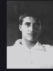
Blessed Pier Frassati