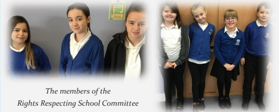
The members of the Rights Respecting School Committee

The Rights Respecting School Committee were delighted to achieve the UNICEF gold award.