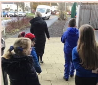
Pupils leading a school tour

In December we experienced a very positive visit from Education Scotland Inspectors. They toured the school, met with a staff focus group, a pupil focus group and our Senior Management team.