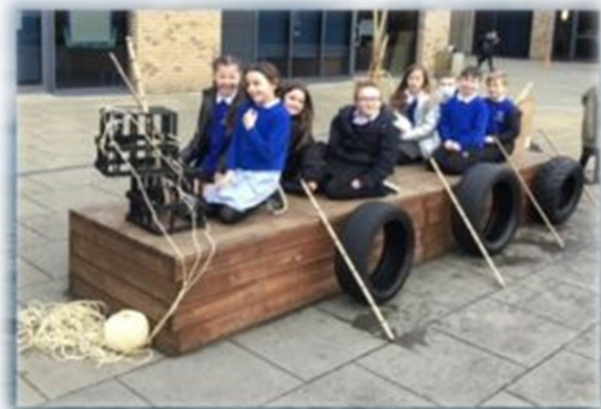
Primary 4 create a Viking longship with loose parts.

Using loose parts to build a den and discussing the importance of risk assessing and using equipment safely to avoid injuries.