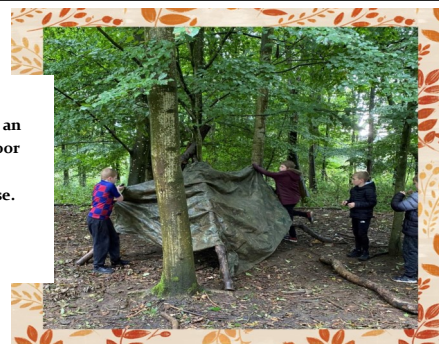
Primary 7 have an amazing Outdoor Experience at Dumfries House.

We were being caring friends as we supported each other round the obstacle course that we built using loose parts.