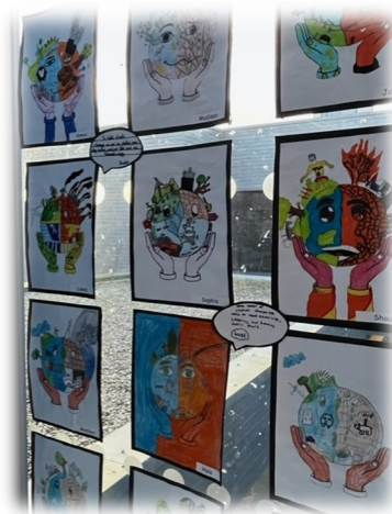
Primary 7 consider Climate Change

COP26 taking place in Glasgow meant there was a huge focus on Climate Change in term 2.