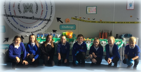
House and Vice-Captains

Once again we have had to adapt the way in which we celebrate positive behaviour. The Captains and Vice-Captains have worked hard to ensure that celebrations go ahead despite restrictions.