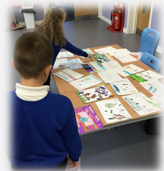
Judging the entries.

As a group we are going to be working with the Eco Committee to help tackle the issue of littering in our local community.