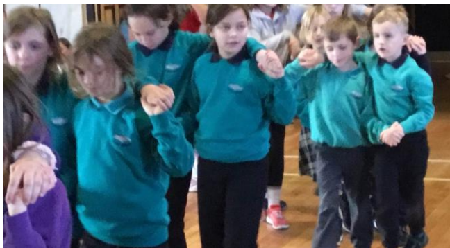
Day of Dance Whiting Bay Village Hall

In addition, there are often after school activities on the island e.g. Sports Club & Pipes & Drums at the High School, Sailing Club in Lamlash (summer term).