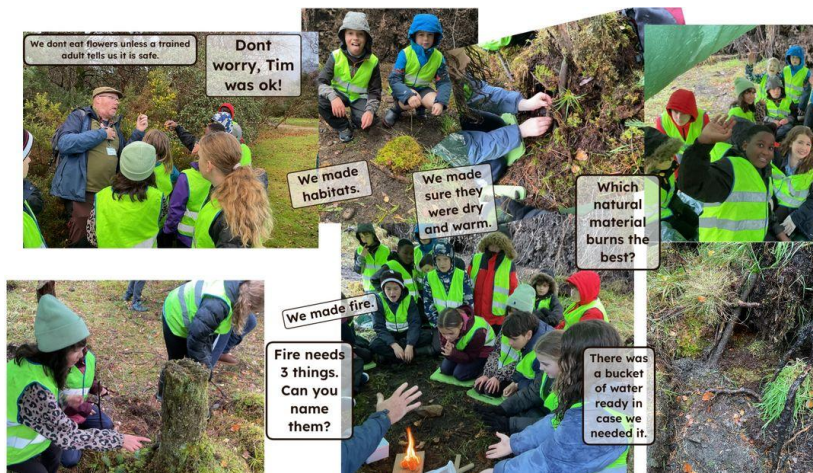
Junior Forester Session

Each school has a named Child Protection Co-ordinator who is the main point of contact for school staff and for external agencies seeking contact with the school on child protection matters. There is an extensive staff-training programme available to staff and, in addition, at the beginning of each school session all staff receive an update on child protection policies, safeguarding and procedures.