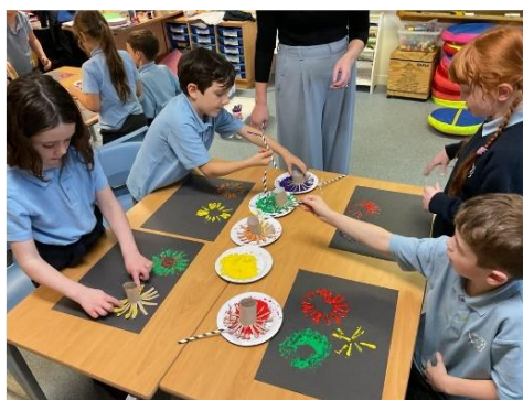
P3/4 using different printing techniques to create an effective firework painting

Please note that, due to pupils with nut allergies, any nut-based snacks/sandwich fillings should not be brought into school. This includes any items labelled 'may contain nuts'.