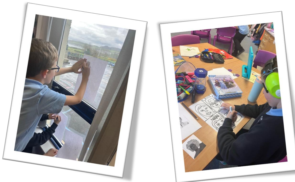
Working hard in P5

If places are available and no additional costs is incurred by the local authority, it may be possible to apply for privilege seat in transport provided by the authority, please liaise with North Ayrshire Transport Hub for further information ( transporthub@north-ayrshire.gov.uk / 01294 541613). Where free transport is provided it may be necessary for pupils to walk a short distance to the vehicle pick-up point. Walking distance in total, including the distance from home to the pick-up point and from the drop-off point to the school in any one direction, will not exceed the Council's limits (see above section). It is the parents' responsibility to ensure that their child arrives at the pick-up point on time. It is also the parents' responsibility to ensure that their child behaves in a safe and acceptable manner while boarding, travelling in and leaving the vehicle. Misbehaviour can result in children losing the right to free transport.