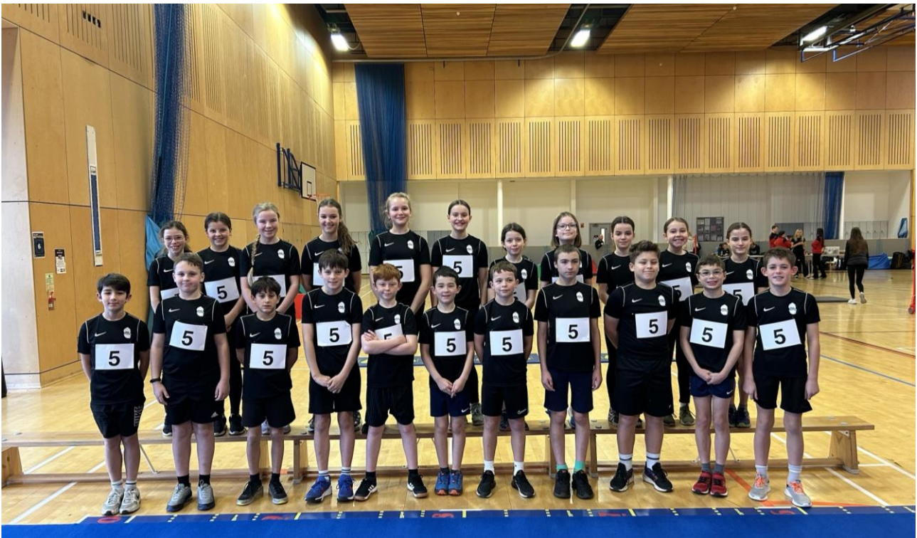
Island Team, Sports Hall Athletics

Parents should encourage their children to follow these rules in the interests of safety.