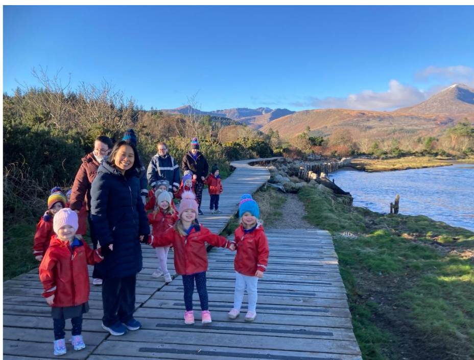
Early Years Winter Walk

Brodick Primary School has a code of conduct to ensure the safety and well-being of all and parents are asked to support the school fully in the matter.