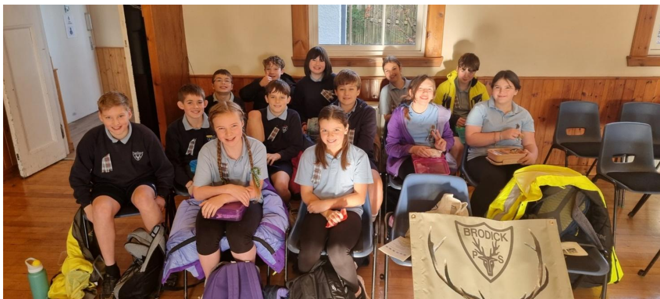
P7 Pupils at the Day of Dance Whiting Bay Village Hall

A Standards and Quality Report and School Improvement plan are produced on an annual basis by every school and centre. Staff, parents/carers, young people and school partners will play an active role in the development of these key school documents.