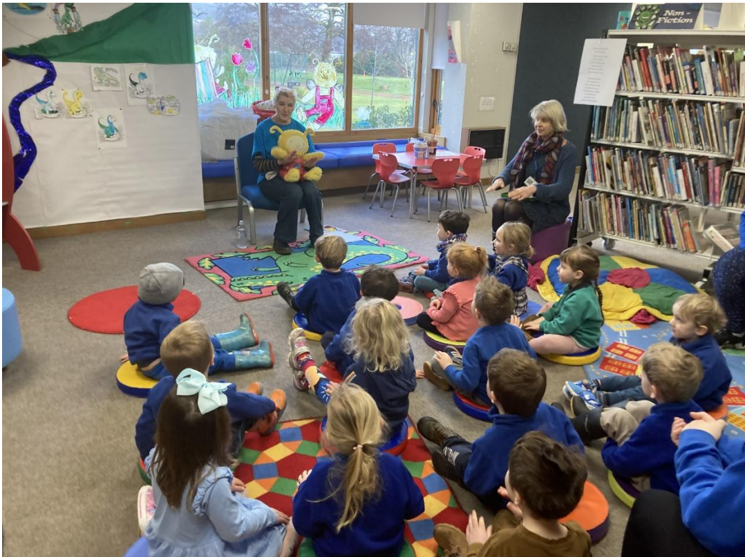
Early Years visiting Book Bug at Arran Library

Website: http://www.sclc.org.uk Telephone: 0131 667 6333 Email: enquiries@sclc.org.uk