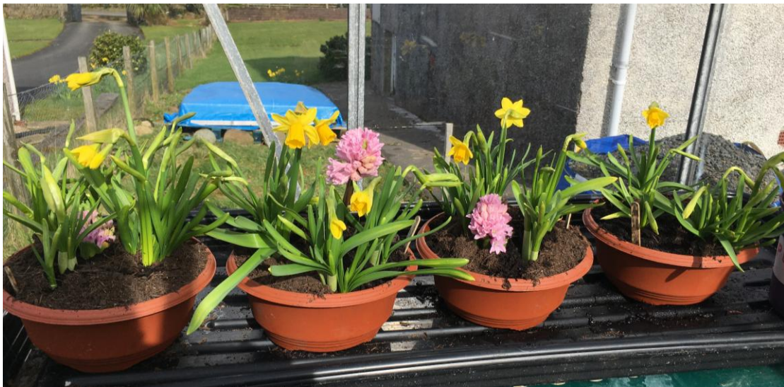
P3/4 Entry to the Village Spring Bulb Show

Parents are welcome to contact the Head Teacher at any time by visiting or telephoning the school.