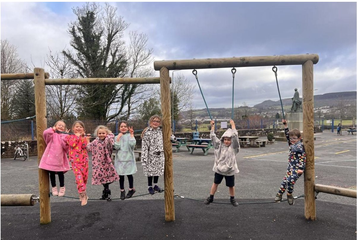
Film Afternoon about to start

Membership of these committees can include pupil representatives from all year groups, staff and parents.