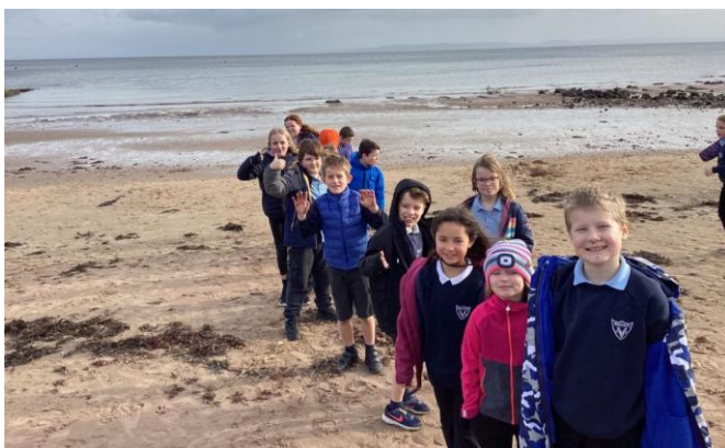
Trip to The Shore, Whiting Bay