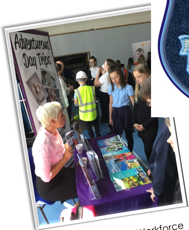
Developing Young Workforce