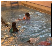
Tarnash Class have been enjoying weekly visits to the swimming pool in Keith, developing life and fitness skills.

We are also looking forward to a pantomime performance "Rick Whittington" which will take place on Thursday 4 th December in St Thomas Church hall. We will be joined by Newmill Primary and Rothiemay Primary Schools. The performance will be funded by PEF.