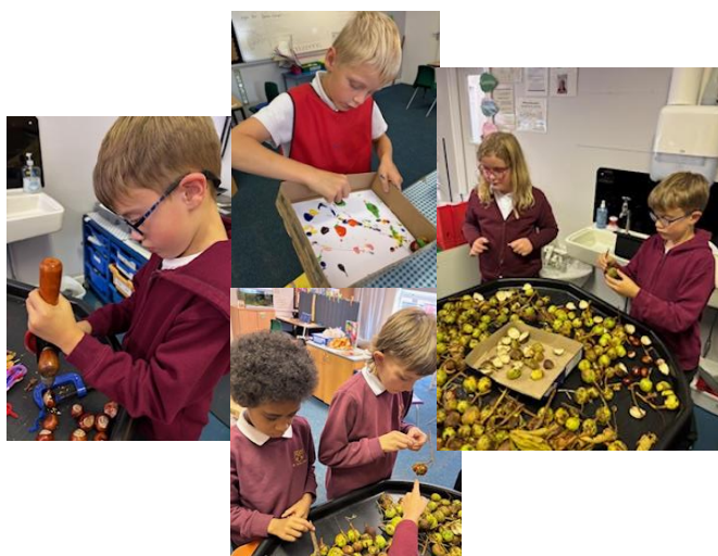
Conker activities in Tarnash Class