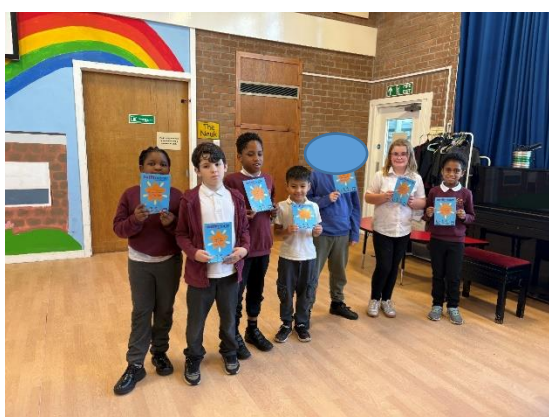
Some of our Bikeability Achievers