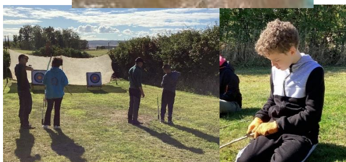
Outfit Moray Adventures for P6-7 pupils in September