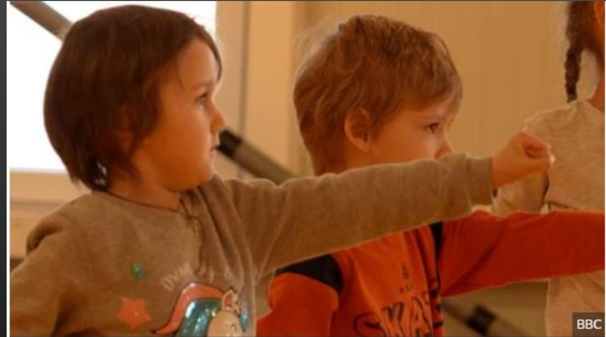
A group of young refugees from Ukraine take part in a karate class in eastern Poland

Whilst children are being put back into school and adults getting homes and jobs the Ukrainians are settling safely in Poland where they'll remain