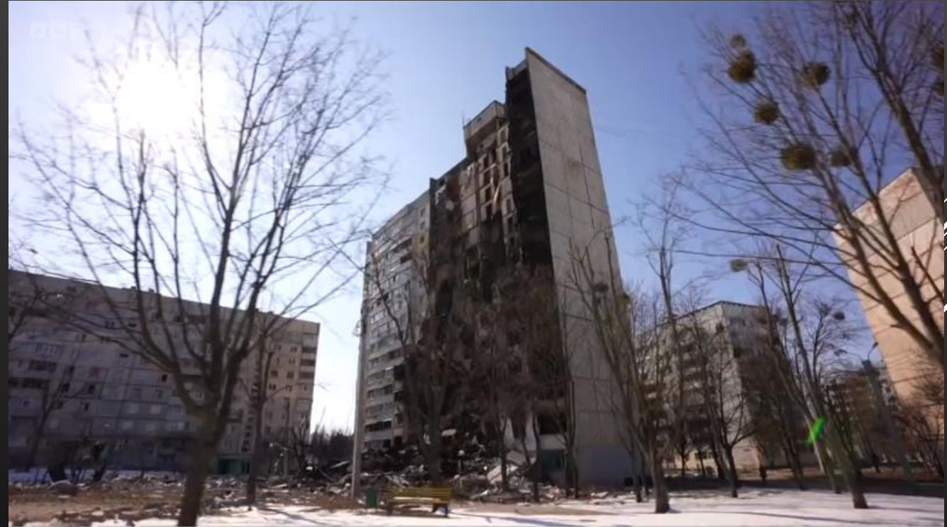
WATCH: The BBC's Quentin Sommerville follows Ukrainian troops holding the front line as Russia pounds Kharkiv

At the moment the Ukraine army is holding up on the front line against Russian troops whilst more refugees get settled and escape.