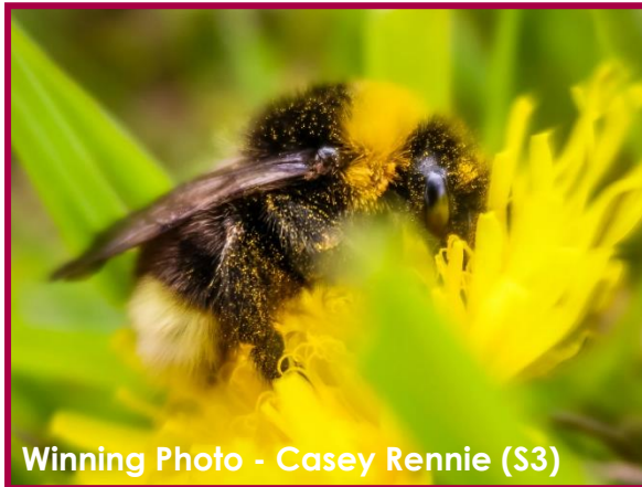
Winning Photo - Casey Rennie (S3)

This year's Photography Competition was our biggest yet- with almost 100 entries! Our judge found it very difficult to reach a decision given the quality of entries. After lots of deliberation, we are pleased to announce the judge's decision.