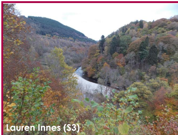
Lauren Innes (S3)