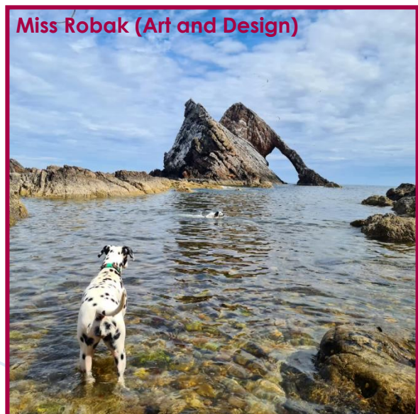
Miss Robak (Art and Design)

I am sure you will agree the quality of pictures shown here is of an incredibly high standard and we are proud of everyone who entered the competition. Well done everyone!