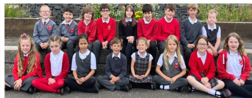
Well done GP 4-7!

the school in March. We need to take better care of our school. We should use our new bins to keep our school as clean and tidy as possible.