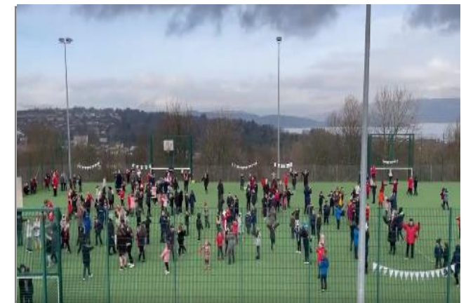
Walk and Talk Event 2022

This month we have been focusing on the learner disposition 'independence'. This means working hard as an individual in class. It is currently Fairtrade fortnight. We have been collecting Fairtrade items and each class has been gathering points. Also, we were involved in the Inverclyde Moves Challenge. P2 and P5/4 did really well with this challenge and won a trophy! We also had our whole school Walk and Talk event which was a huge success. It was also Languages Week Scotland this month.