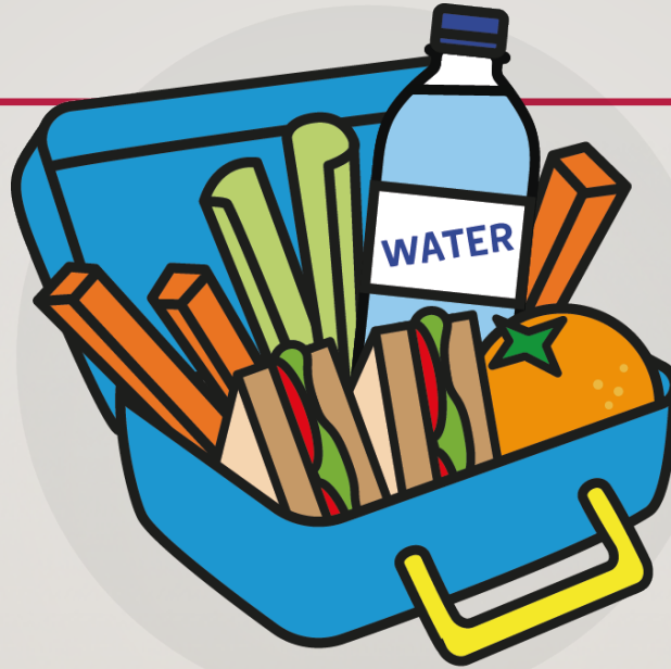
Packed lunch or order from the school menu