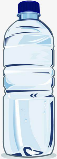
A filled water bottle