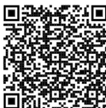
Scan QR code for help video