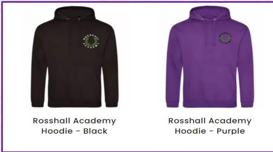
Rosshall Academy Hoodie - Black