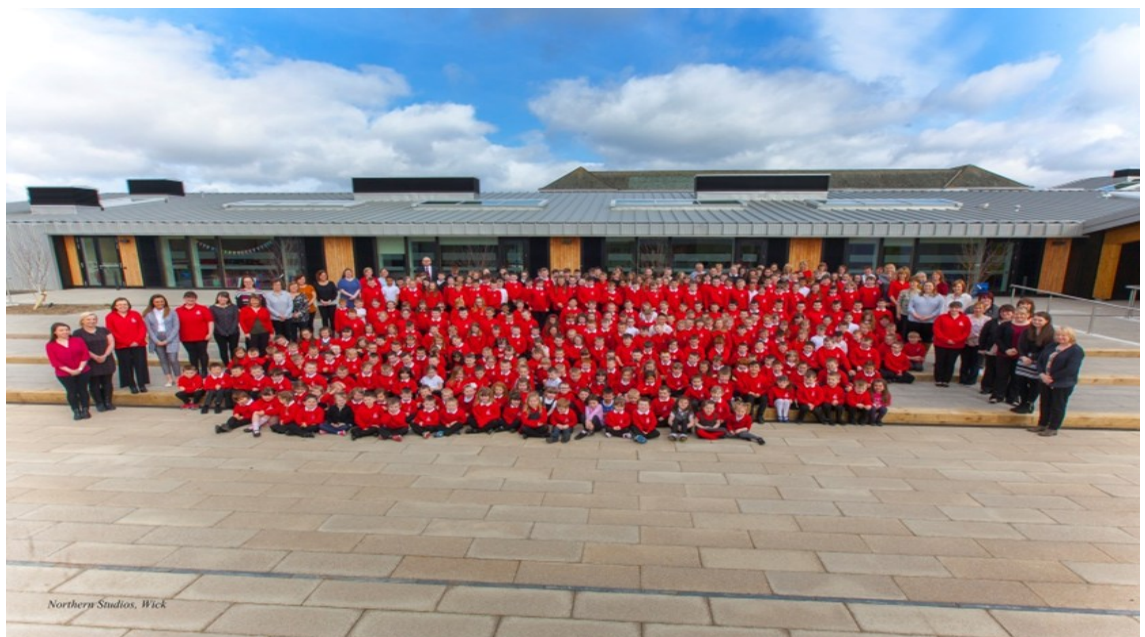
The staff and pupils of Noss on our opening day in April 2016.

We look forward to getting to know both you and your child.