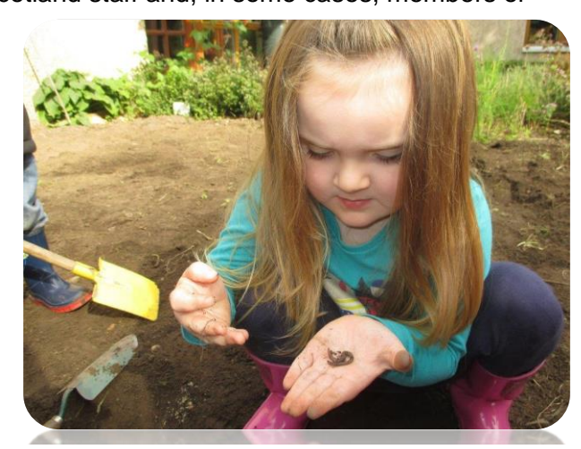
Girl at Doune Nursery gets to grips with nature

The visits to the schools and centres took place between June and September 2014.