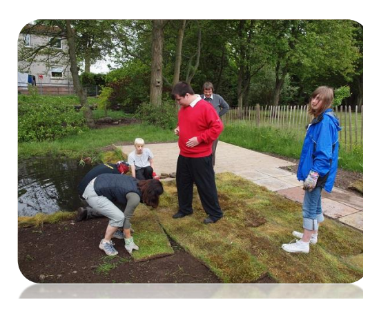
Putting finishing touches to the pond at Kilmaron Schoo

The case studies included in this report provide details about the journey each school and centre has taken and describe the main activities and programmes they have supported. They also, through the inclusion of quotes, attempt to capture the richness of the discussions that took place. They