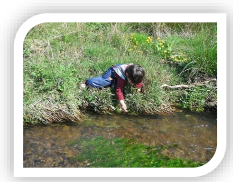
Enjoying time to be curious and explore at Stickland