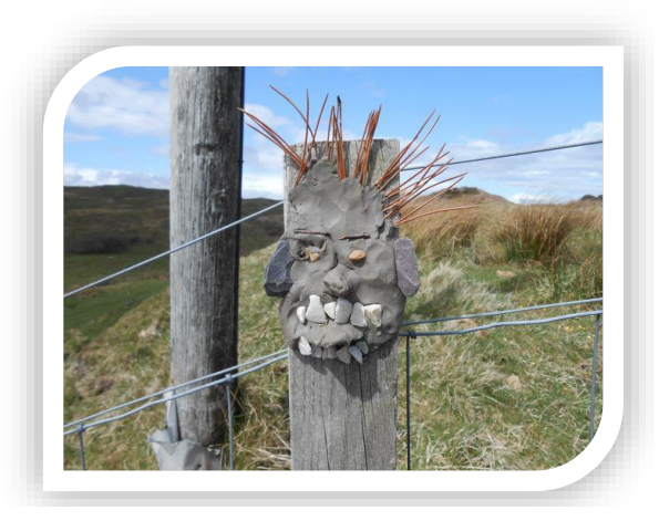
Even fence posts in Luing have character

Confident and well-behaved children who are very proud of their school and enjoy the wide range of activities to raise achievement