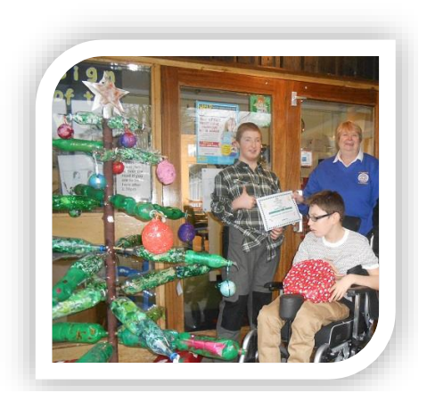
Learners admire their recycled Christmas tree

The strong emphasis on communication within the school was highlighted as a key strength in its most recent inspection report in May 2014. The