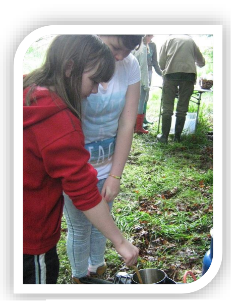
Brewing a hot drink at Forest Schools

Craigievar School was one of the first schools in Scotland to become a Forest School. Since 2008 the children in primary four to seven have been visiting the local forest on a regular basis for a whole day of outdoor learning. In recent years, the school has increasingly linked the activities in the forest to the curriculum to ensure learning indoors and outdoors are