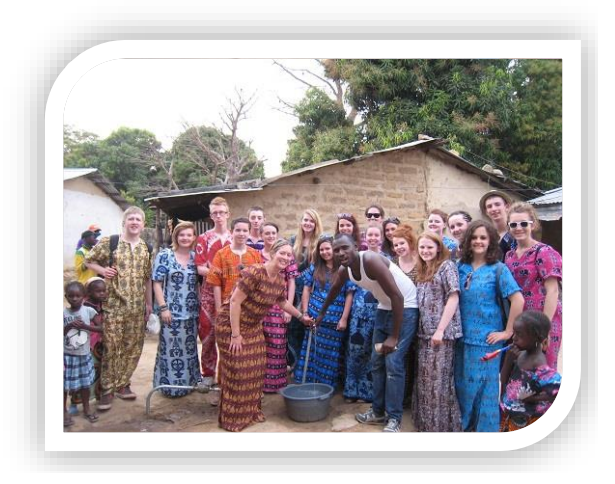
Installing a new water tap in their link community in Gambia

The school's extensive international and global citizenship programme grew out of a desire to expand the horizons of learners and connect them to the wider world. A link with Xiamen, China, provided the initial impetus in 2006. This partnership has grown to include reciprocal learner and staff visits to China and the granting of Confucius Hub status in session