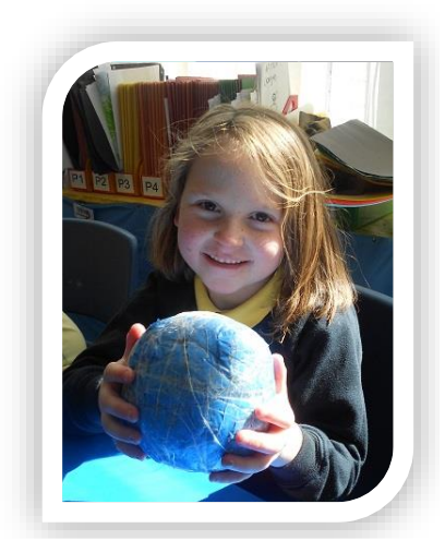
Having a ball with global citizenship