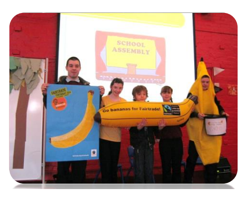
Learners at Mary Russell School at their Fairtrade assembly

Sustainable development education, global citizenship, international education, education for citizenship and outdoor learning have now been embedded within the national curriculum - Curriculum for Excellence, and many schools are successfully weaving these together with children's rights and play to develop coherent whole school approaches to learning for sustainability.