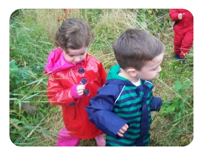
Learners at Auchnacraig Nursery go in search of wild spaces

The future is yet unwritten and we cannot know what challenges and triumphs will await us in the coming years. However, if the case studies in this document are anything to go by then we can be confident that children and young people across Scotland are being encouraged in large numbers to care deeply about justice and are being equipped with the skills, knowledge, confidence and leadership abilities required to find solutions and build a more sustainable Scotland, and a better world.