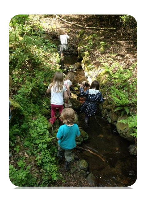
Learners from Cowgate Under 5's Centre venture up a stream at Stickland

Scotland embraced the opportunity and the Scottish Government produced two action plans, Learning for the Future <sup>3</sup> and Learning for Change <sup>4</sup>, to set out its ambitions and targets for each half of the Decade. Within the school sector, the biggest achievements have arguably been the embedding of global citizenship and sustainable development education as themes across learning<sup>5</sup> within the new national curriculum, Curriculum for Excellence. The embedding of outdoor learning<sup>6</sup> as a key pedagogical