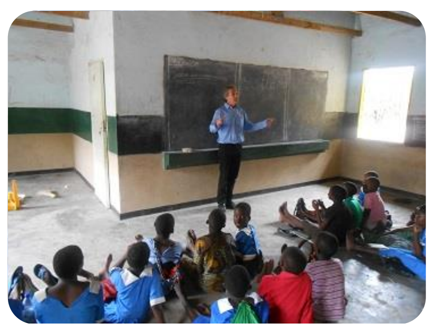
The link with Malawi has promoted understanding of other peoples and cultures