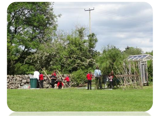
Space to explore at Palnackie Primary

A few parents became much more actively involved in Parent Councils and other groups in their child's primary school as a result of the experience their children had at early years. Their motivation was to help the primary school adopt similar approaches to learning for sustainability and outdoor learning that the early years establishment had taken. Parents often remarked how the experiences provided by the schools and centres challenged them