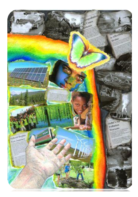
Cover image of the Learning for Sustainability Report

This provided an important marker for the One Planet Schools Working Group which was established following the Scottish Parliamentary Elections in 2011. The remit of the group was to provide strategic advice and direction to Ministers to support the delivery of the Scottish National Party's manifesto commitment which stated, 'We welcome proposals for the creation of One Planet schools, and will