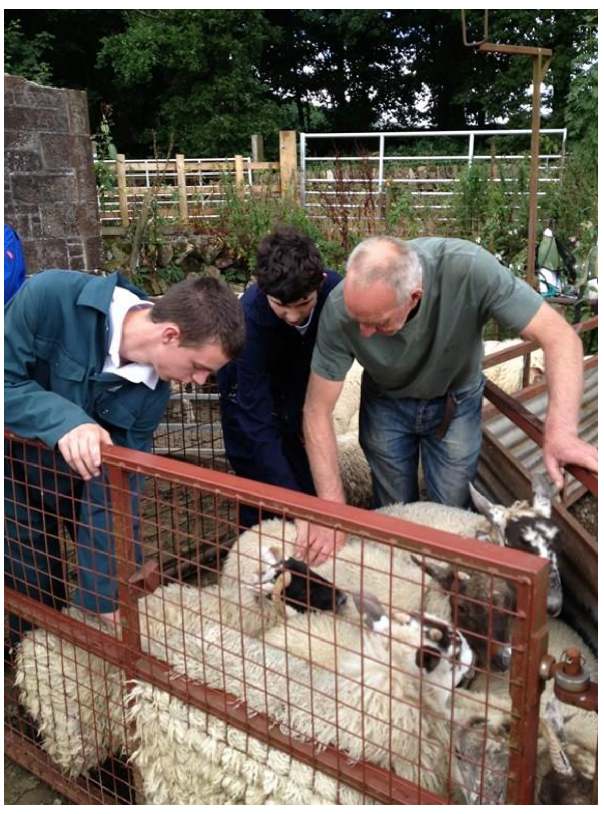
Learners from Wallace Hall Academy working with local farmer through the Queensberry Initiative