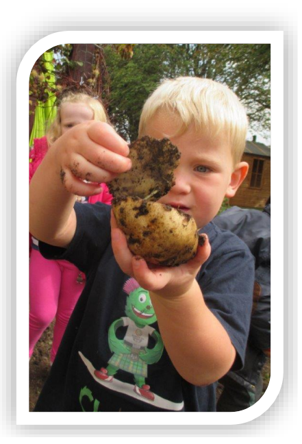
Harvest time at Doune Nursery

Since its opening, the nursery has focused on the importance of the children's voice in the learning process. The nursery has developed many strategies to ensure children are respected and that their views are listened to and made visible. This focus is supported by a local authority focus on the United Nations Convention on the Rights of the Child and desire to embed a pedagogical Documentation Approach <sup>40</sup> to children's early learning in their early years establishments. The nursery currently holds a Level One UNICEF Rights Respecting School Award. The staff talk to children about their rights and in particular focus on the importance of being respectful to themselves and to the environment.