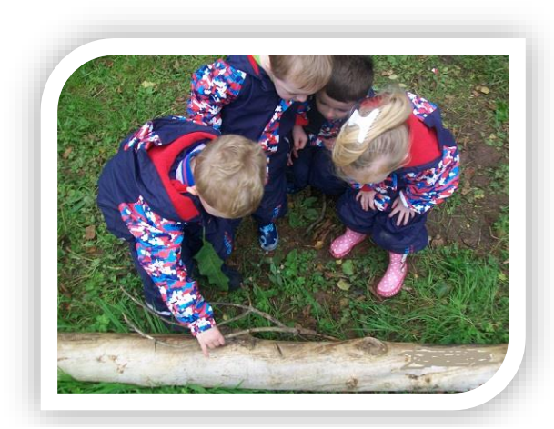
Learners enthralled by a Forest School activity

Outdoor learning is a key feature of learning at Auchnacraig and, in the 2011 inspection report for the centre, the quality of the children's learning experience outdoors and in the Forest School were identified as key strengths. Also highlighted was the strong and supportive partnerships with parents, the inclusive nurturing environment for learning and the focus that was given to