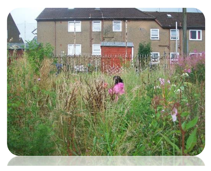
Children enjoying wild spaces