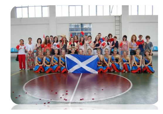
A visit to No. 3 Middle School, Yuxi, China