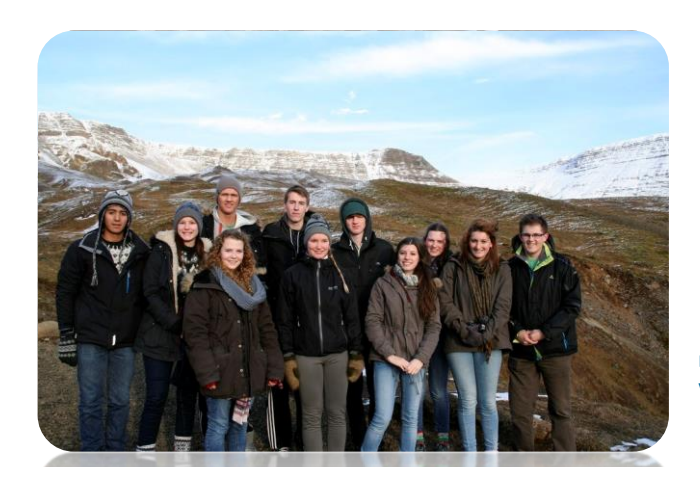
Learners on their Comenius visit to Iceland

The school has active Eco-Schools and Fairtrade groups and a Pupil Council. Learners also help to run a community orchard which was established to reduce food miles, encourage healthy eating and to provide opportunities for the community to become more involved with the school. And in 2014, senior learners participated in a Commonwealth Youth Summit linked to the Glasgow 2014 Games.