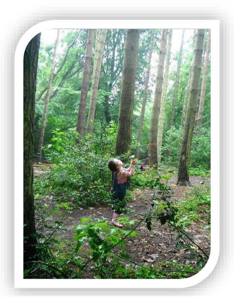
Enjoying the wonder and awe of nature at Stickland

The quality of the experiences that Cowgate offers learners has been recognised in a number of ways. In 2008 the centre won the Nursery World Awards and it has also achieved an Investors in Children Award. The centre has also gained four Green Flag Awards with Eco-Schools Scotland and in its most recent inspection in 2014 the quality of children's learning at Cowgate was described as 'outstanding'. As a result of its achievements, the centre receives many national and international visitors.