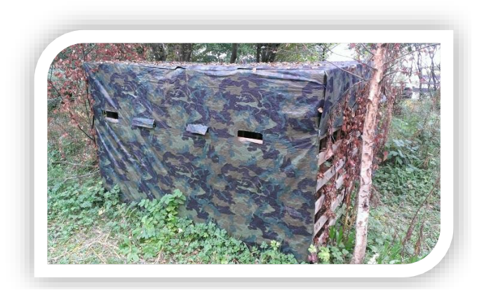
Bird hide made from wooden pallets

Pupils' active involvement in learning and their skills in listening, talking and working together.