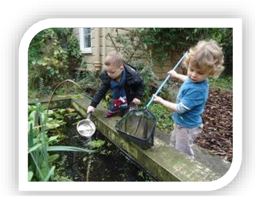
Learning to be scientists

The nursery's journey towards sustainability began in 1992 when it sought to transform its tarmac playground into an imaginative and stimulating environment that would provide ample