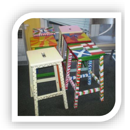
Upcycling old science lab stools

Sustainable development education (SDE) has been a large part of the school's culture and ethos for more than 10 years and has been supported by the passion and commitment of the recently-retired headteacher who was amongst the first group of practitioners to gain Professional Recognition<sup>43</sup> in SDE from the GTCS. Key to the school's approach has been to embed sustainability within the curriculum at all levels, for example, through themes relating to fossil fuels, transport and the