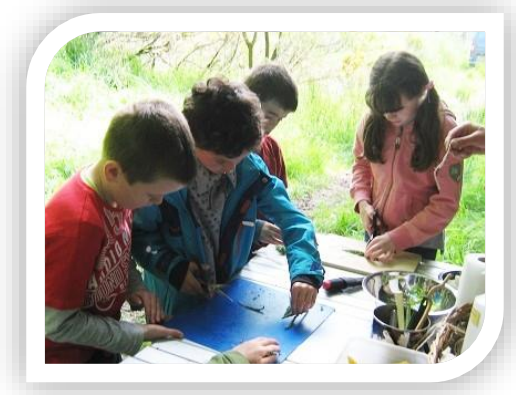
Expressive arts in the forest