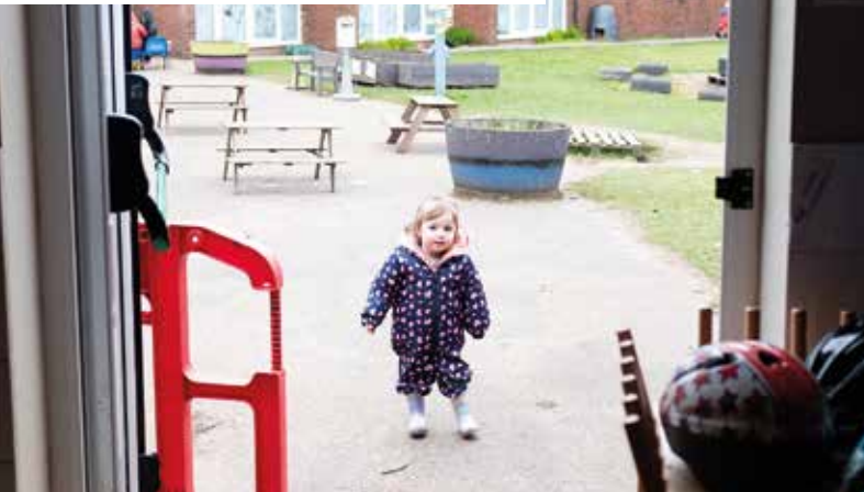
Into the boot room