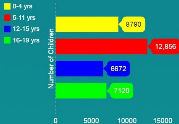
Insight Falkirk 2016 Data